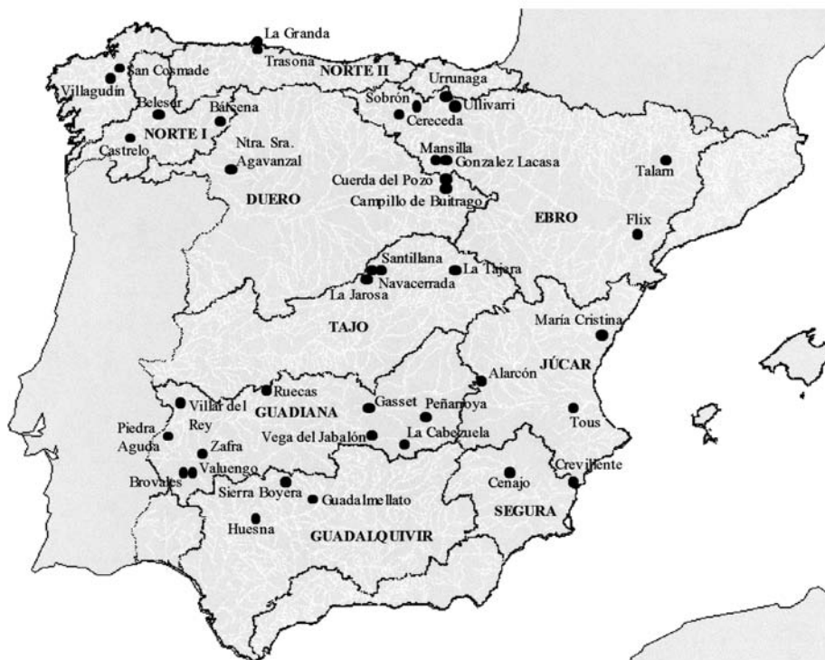
Figure 1. Distribution of the studied water reservoirs in the administrative Spanish water basins. Distribución de los embalses estudiados en las cuencas hidrográficas en las que se divide administrativamente el territorio español.

We studied 40 reservoirs located in the main administrative water basins of Spain: Duero, Ebro, Guadalquivir, Guadiana, Júcar, Miño, Segura, Tajo, Norte I, and Norte II (Table 1, Fig. 1).